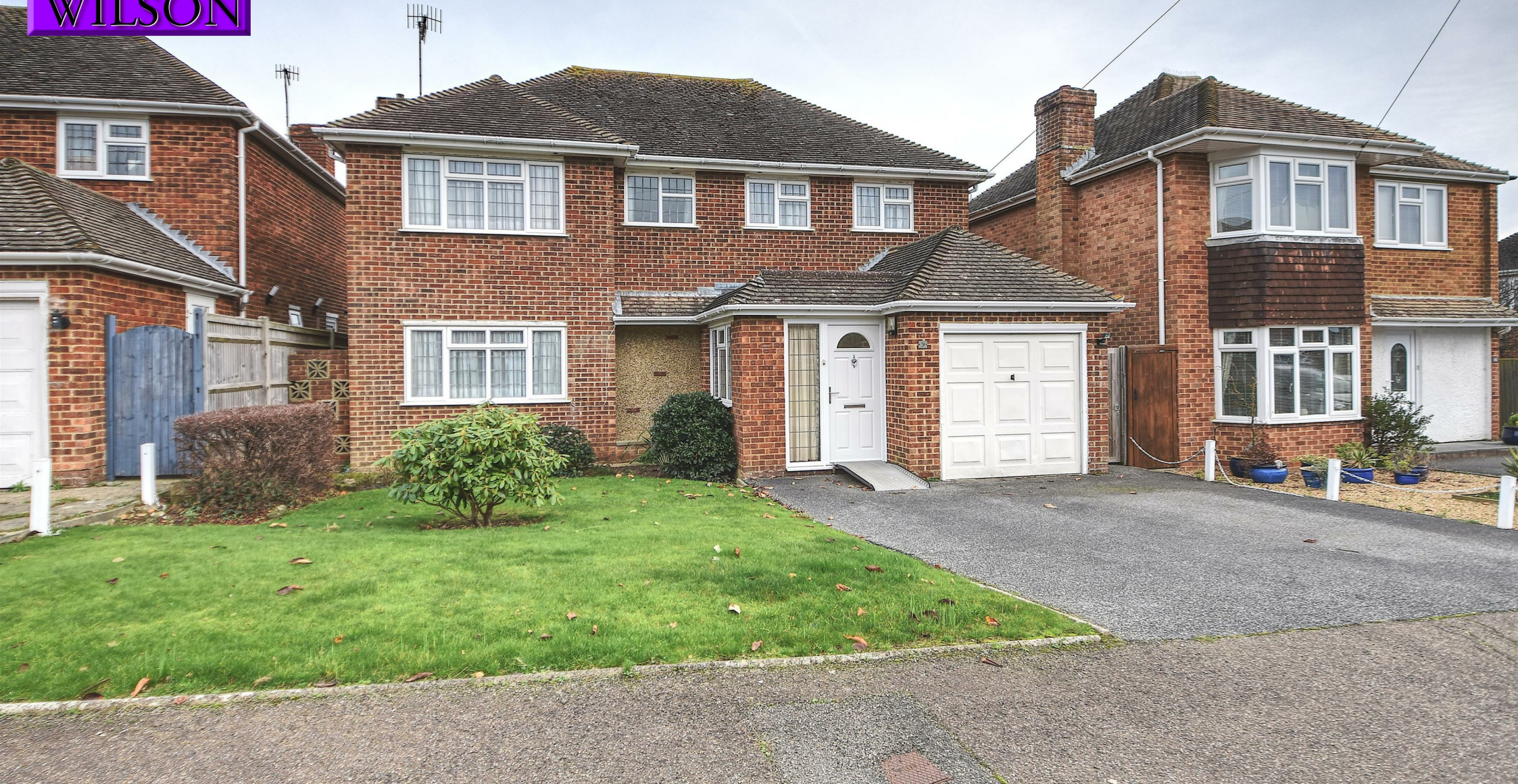
9 The Spinney, Bexhill-On-Sea, Sussex TN39 3SW £595,000